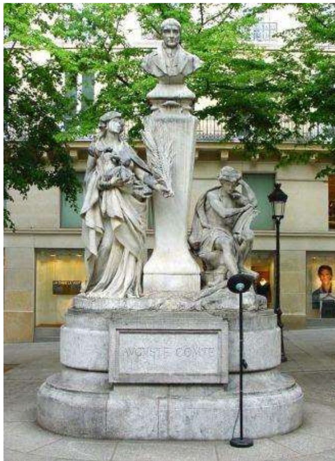
Auguste Comte (Place de la Sorbonne)